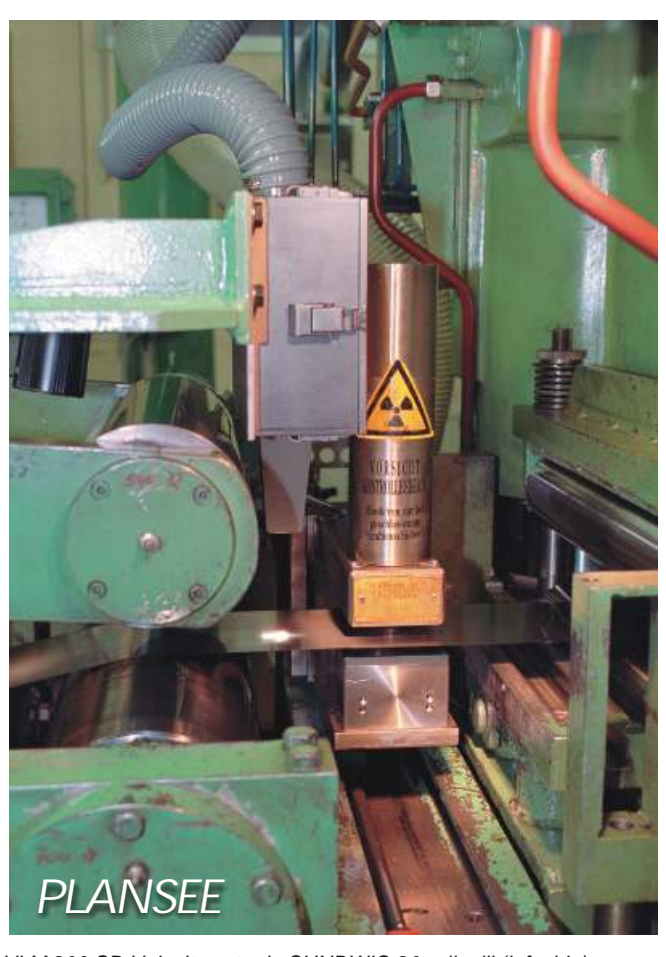
VLM 200 SD Velocitymeter in SUNDWIG 20-roll mill (left side)

The high performance of a 20-roll mill stand can only be realised with modern electronic control technology that helps to obtain high strip quality. Modern constant volume controls require reliable dynamic speed values that can be advantageously recorded by the VLM 200 SD. This opens up a new perspective for the realisation of exact strip thickness.