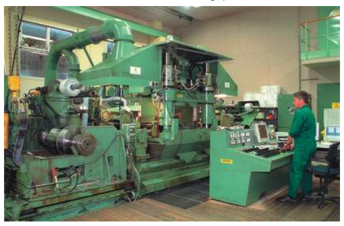
Control panel of the mill stand

product. Molybdenum and its alloys are mainly used as materials because of their high mechanical stability at high temperatures. In nature, tungsten is found in more or less the same quantities as copper and has the highest melting point of all metals of